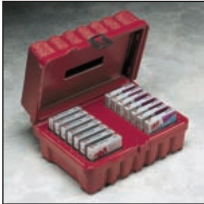
4MM-14 4mm/DDS/DAT cartridge • 14 capacity