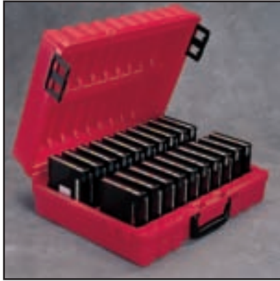
9840/9940-20 9840 / 9940 / T10000 Cartridge • 20 capacity STK Recommended