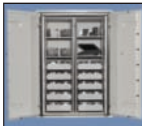
DATA COMMANDER 4620 SERIES Fireproof