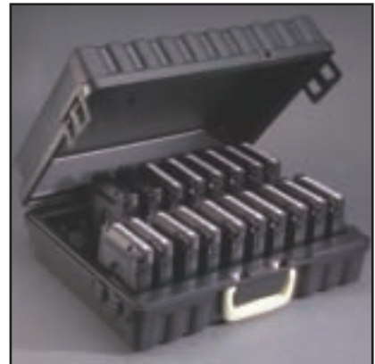
3592-20 3592 cartridge • 20 capacity IBM Recommended