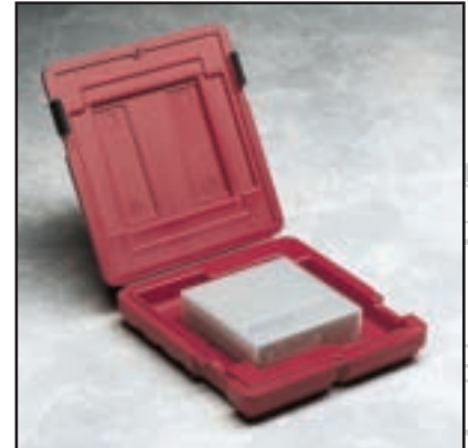
MAILER4 DLT/LTO/OPT 525DC • 1 capacity MAILER4 3570 2 capacity • Not Shown