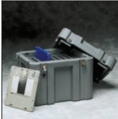
OPT12-9 12" optical platters • 9 capacity