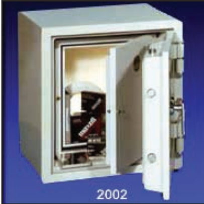
DATA CARE 2000 SERIES Fireproof • Stores 10 to 120 DLT tapes.