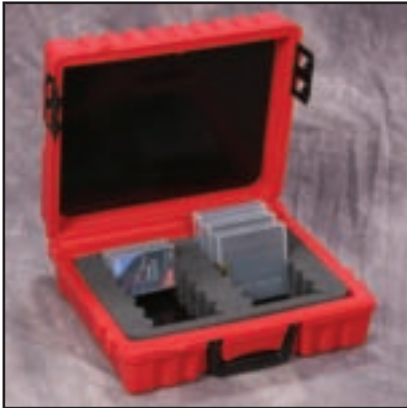
MID-MULTI Securely holds 15 mixed DLT / LTO cartridges MINI-MULTI Securely holds 5-6 mixed DLT / LTO cartridges or more 4mm/8mm etc. (not pictured)