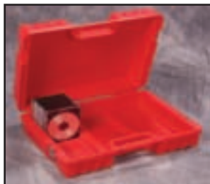
CD/DVD-55 Securely holds 55 CDs or DVDs or 110 Slimline