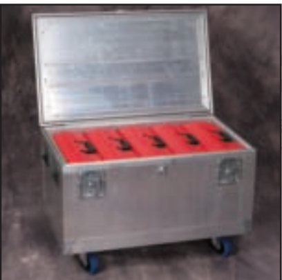
MASTER-5 ALUMINUM Holds 5 "D" or "E" size Turtle Cases (sold separately). Lockable, Insulated, fire resistant, water proof, caster wheels.