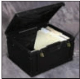
LocDocBox Securely stores letter and legal documents