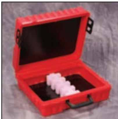
DC525-10 (T600) 5.25" Magnus/MLR/SLR data cartridge • 10 capacity