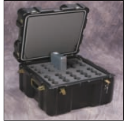
HARD DRIVE-10 SHIPPING CASE External/Hot swappable hard drive carrying case • 10 capacity