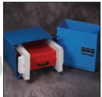
TUR10ECC Overpack box for "B" and "C" size cases. IBM Recommended TUR20ECC Overpack box for D size cases. IBM Recommended TUR40ECC Overpack box for E size cases. IBM Recommended