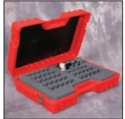
HARD DRIVE-10 CARRYING CASE External/Hot swappable hard drive carrying case • 10 capacity