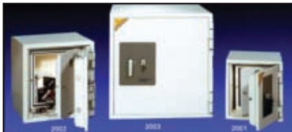
DATA CARE 2000 SERIES Fireproof