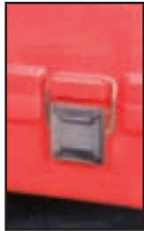
New metal latches on large and medium Turtle media transport cases