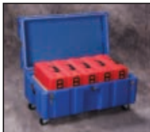
MASTER 5 BLUE Large Shipper/Master container for 5-6 Turtle cases