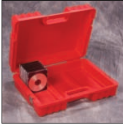
CD/DVD - 55 5.25" CD/DVD - 55 capacity (110 if slimline cases)