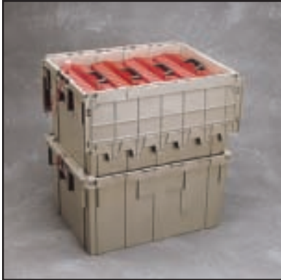
MASTER-4 Holds 4 "D" size Turtles MASTER-2 Holds 2 "D" or "E" size Turtles Turtle cases sold separately.