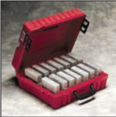
DLT14 DLT cartridge • 14 capacity