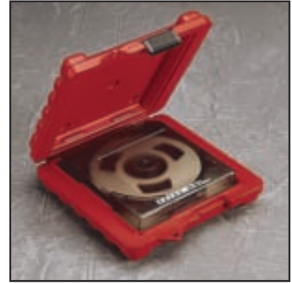
MAILER 1 3590/9840 SD3 / 3480 / 3490E / 3590 / 3592 / 9840 / 9940 / ZIP • 1 capacity