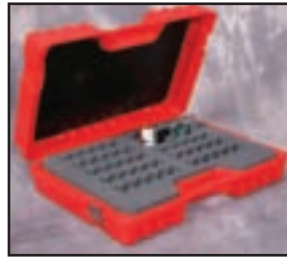
HARD DRIVE-10 CARRYING CASE External/Hot swappable hard drive carrying case 10 capacity