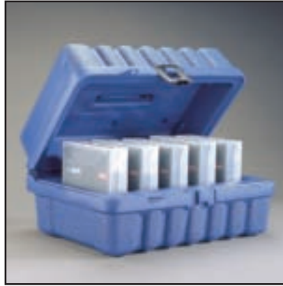
LTO5 Ultrium LTO cartridge • 5 capacity IBM Recommended