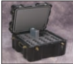
HARD DRIVE-10 SHIPPING CASE External/Hot swappable hard drive carrying case 10 capacity