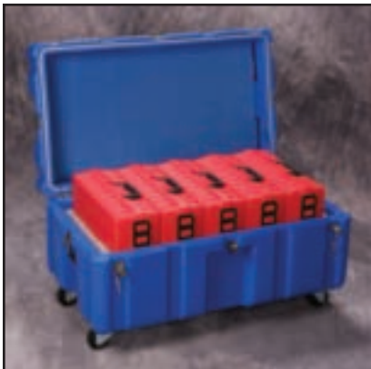
MASTER-5 BLUE (MAS100E) Holds 6 "D" or 5 "E" size Turtle Cases. Lockable, Caster Wheels, Gasket. Sold with or without cases.