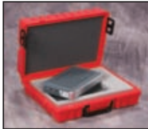
HARD DRIVE MULTI-2 Hard drive case with adjustable foam 1-2 capacity