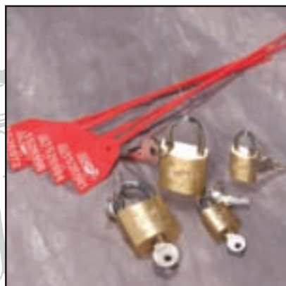
TSS500 Security Seals, sequentially numbered TURTLE 5020 Brass Lock, 2 keys, Fits all Turtle Cases (except Mailers) T8180 Safety Tape, yellow w/international symbols 2" x 110 yds. TMM Turtle thermometer adheres to inside of a Turtle Case. Allows user to view temperature for proper operating and storage environment of their tapes. Pack of 25 thermometers. Not pictured