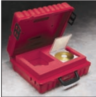
OPT5.25-10 5.25" optical disks 1/2" thick • 10 capacity OPTCD-20 5.25" CD • 20 capacity or 40 slimline