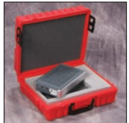
HARD DRIVE MULTI-2 Removable hard drive case with adjustable foam • 1-2 capacity