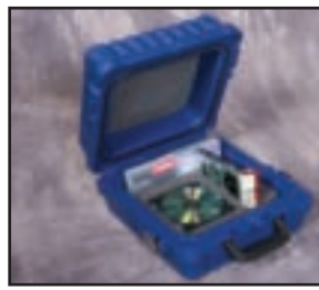
UNIVERSAL CASE Waterproof, multiple format case with adjustable foam. Holds 14 DLT/LTO cartridges or equivalent.