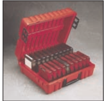
3590-20 (TUR20) 3480 / 3490E / 3590 cartridge • 20 capacity • IBM Recommended