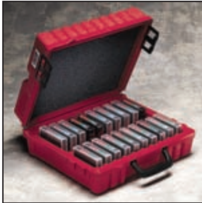
8MM-20 (8MMS) 8mm/AIT/VXA cartridge • 20 capacity or Travan minicartridge • 20 capacity