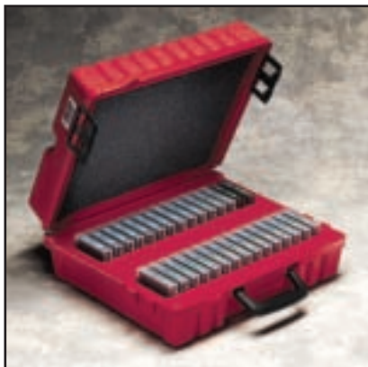
4MM-30 4mm/DDS/DAT cartridge • 30 capacity