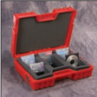
ULTI-MULTI Securely holds 25 mixed DLT / LTO more 4mm/8mm etc.