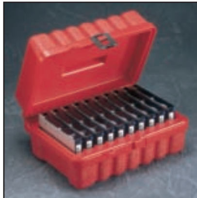
3570-10 3570 Magstar MP • 10 capacity IBM Recommended