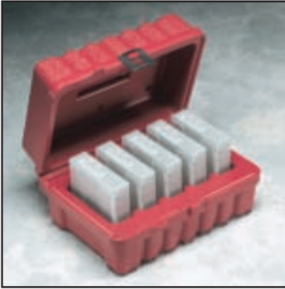
DLT5 DLT cartridge • 5 capacity