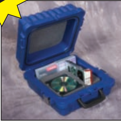
UNIVERSAL CASE Waterproof, multiple format case with adjustable foam. Holds 14 DLT/LTO cartridges or equivalent.