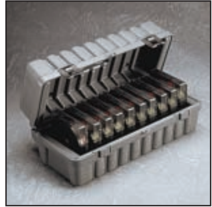
3590-10 (TUR10) 3480 / 3490E / 3590 cartridge • 10 capacity IBM Recommended 3590-10 CONDUCTIVE Not Shown