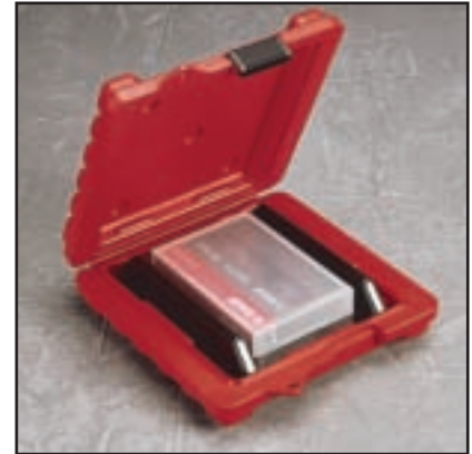
MAILER2 4MM/8MM 8mm/AIT data tape 1 capacity, or 4mm data tape 2 capacity