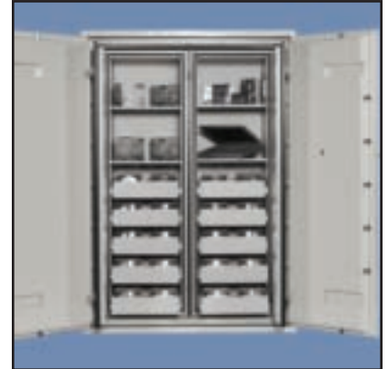
DATA COMMANDER 4620 SERIES Fireproof • Pull out drawers; shelves. Stores 120 to 432 DLT tapes.