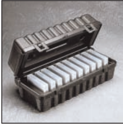
8MM-10 (TUR8MM) 8mm/AIT/VXA cartridge • 10 capacity