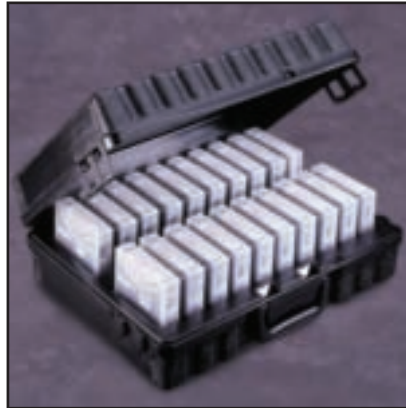
LTO20 Ultrium LTO cartridge • 20 capacity IBM Recommended